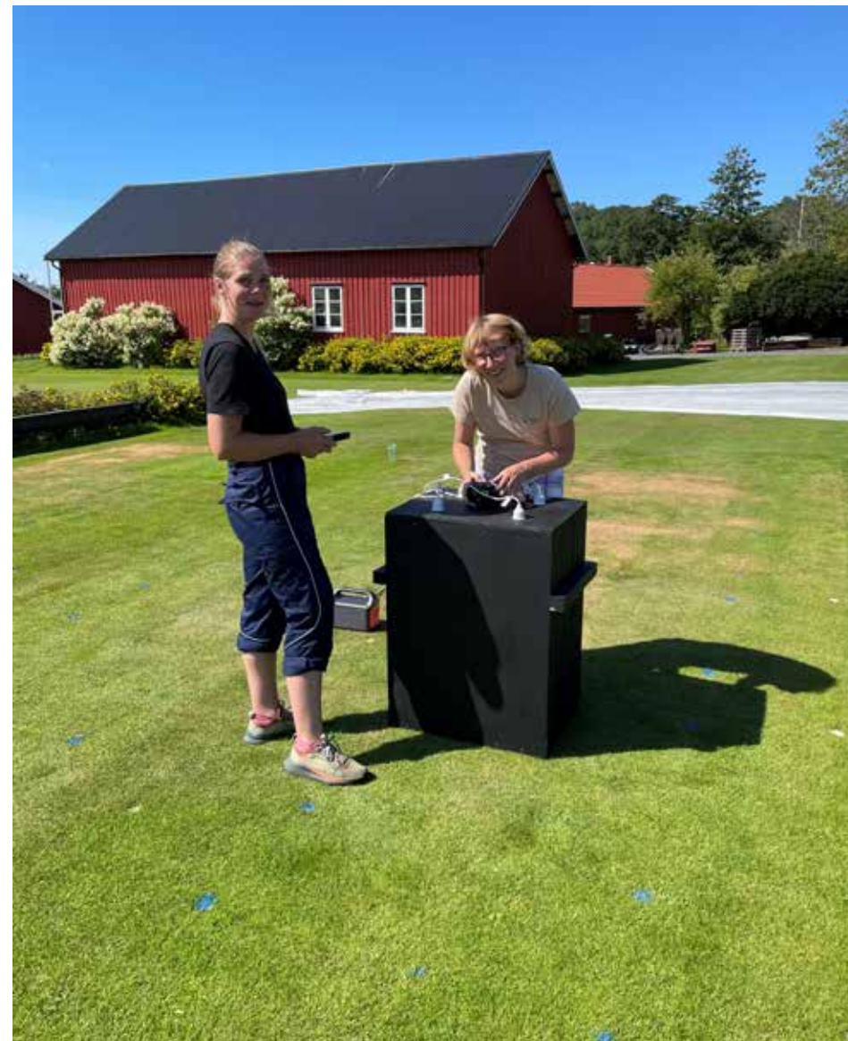
Taking digital images in a light box.

In WP3, we are planning parallel trials to be conducted at NIBIO Landvik, Norway, and Osnabrück University, Germany, in 2025 (and perhaps 2026), combining the most drought-resistant varieties from WP1 with the best surfactants from WP2.