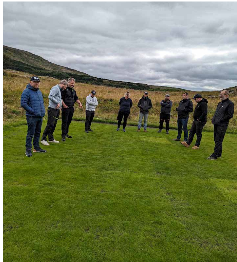
Field walk at Reykjavik GC, August 2023

New experimental greens were established at Apelsvoll and Smørum in June, and at Reykjavik and Landvik in July. Establishment was most successful at Reykjavik, while many of the plots had to be reseeded at Landvik in August and September. At Apelsvoll, plots with Kentucky bluegrass were also reseeded. At Smørum, most of the green was reseeded in August. In October, some of the plots with Kentucky bluegrass and smaller cat's-tail were still not fully covered at Landvik, Apelsvoll and Smørum. The challenges with establishment are likely explained by the very dry weather in Norway and Denmark in June. At Minnesota, the experimental green was established in early September due to problems with delivery of the seed package from Norway.