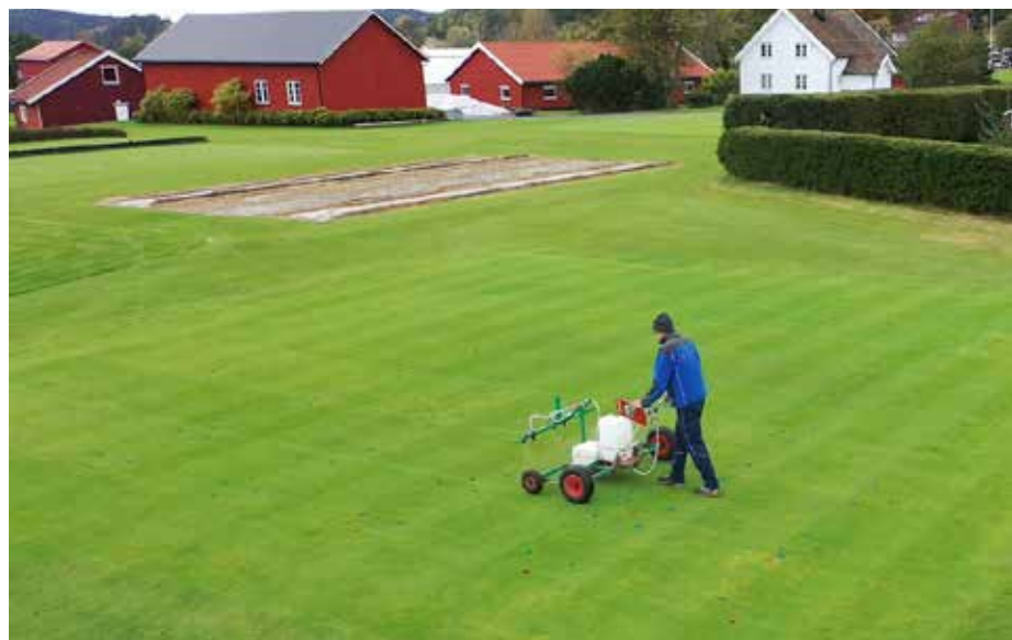
Fertilising experimental golf green at Landvik on 14 October 2021.

15 November: Les 48h du Gazon Sport Pro, Paris, France. ‘Effects of UV-C radiation and Sustane slow-release fertiliser on turfgrass diseases on golf greens’. W. Prämaßing.