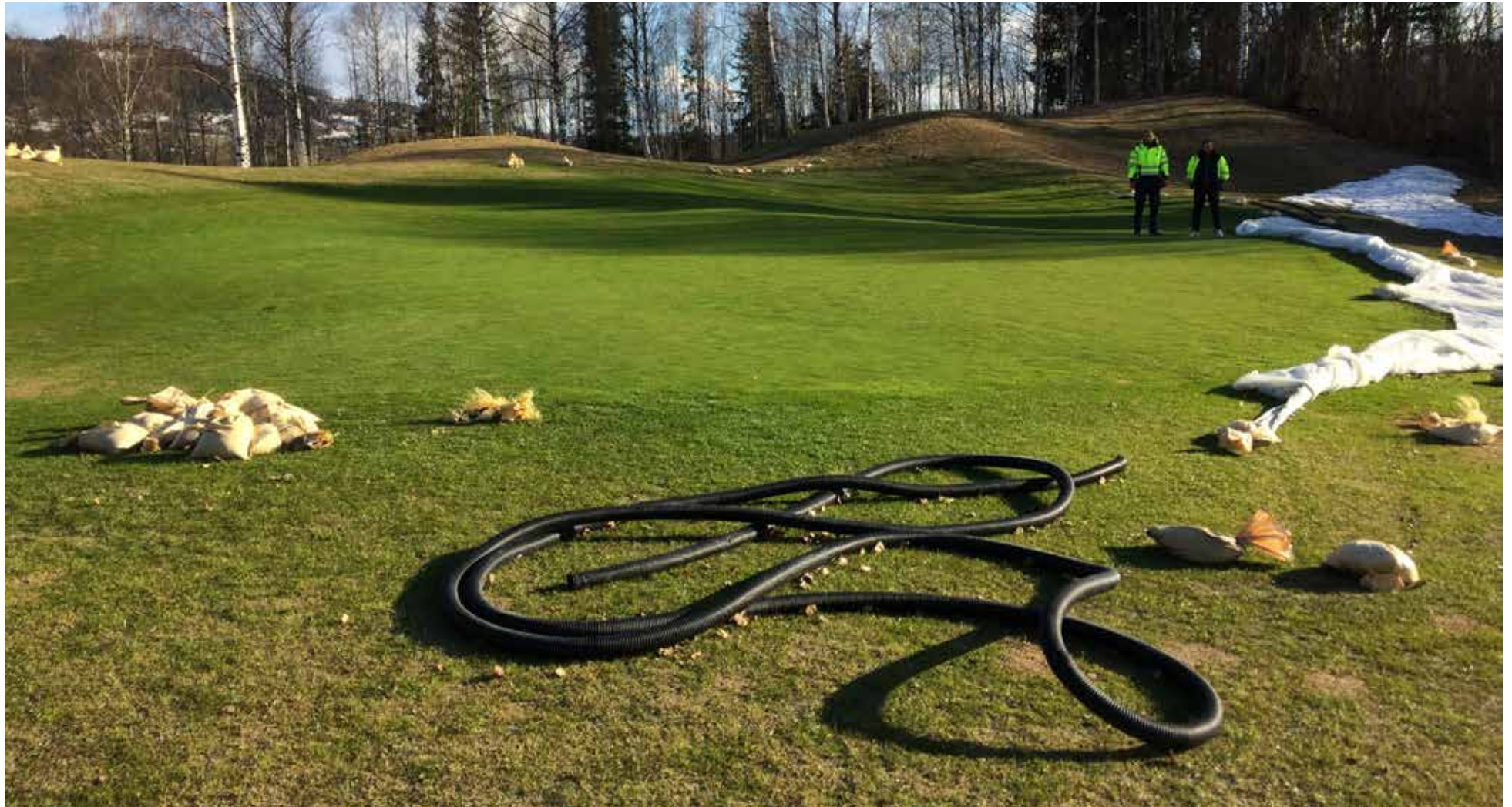
Excellent survival after ventilation under plastic covers on green 4, Holtmark GK. Project: ICE-BREAKER, 27 April 2023.