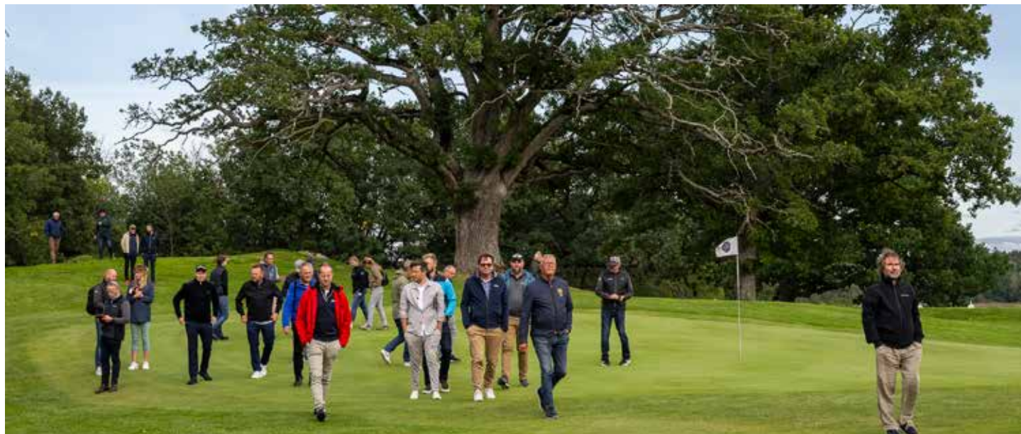
Field Day at Sigtuna Golf Club, presenting their successful biodiversity programme and sustainable course management.

The initiative will have two important committees. A steering committee , consisting of representatives of the funding organisations (STERF, USGA and R&A) will continue to plan and execute the initiative, appropriately representing the interests of the organisations funding the work. The steering committee will nominate, select and oversee the work of 10-12 people (scientists, agronomists and industry practitioners) serving on a proposal review committee .