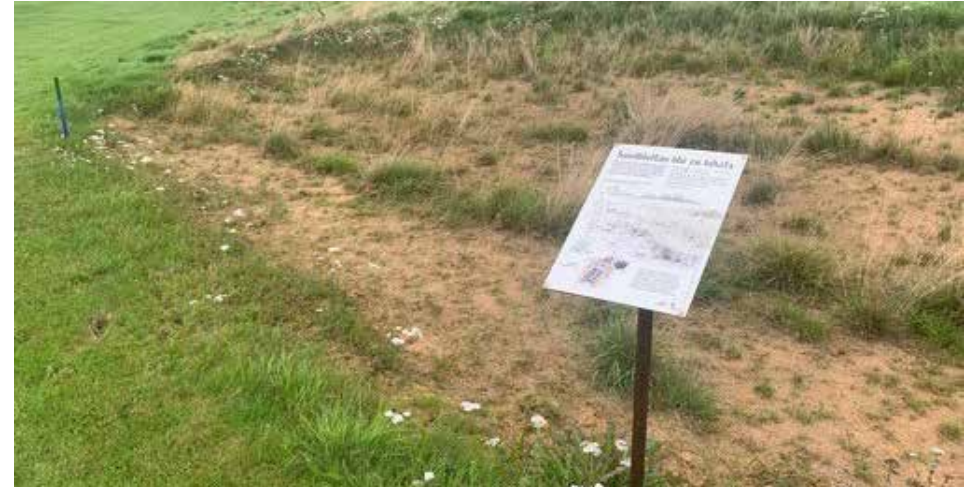
Signs have been placed at different habitat types.