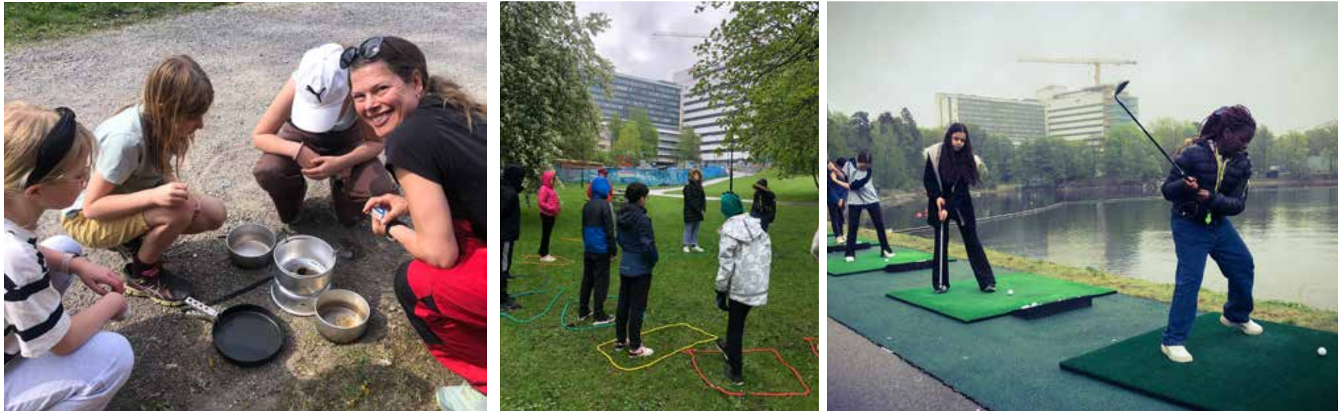
From left to right: Learning how to assemble a storm kitchen and boil water as part of a sports lesson on Mälare GC. Geometry lesson and trying out golf at Stockholm GC.

and when local areas suitable for outdoor activities are becoming scarce. In STERF's pilot project at Motala Golf Club in collaboration with Smedsby School in Motala, methods for outdoor teaching on golf courses and the most suitable areas of the golf course for use as an outdoor classroom were investigated.