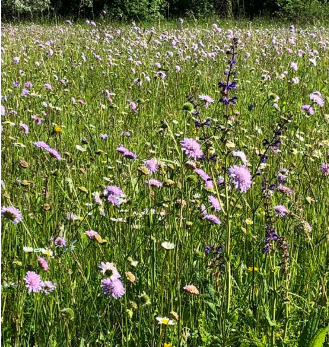
Restored meadow at Hangenham.