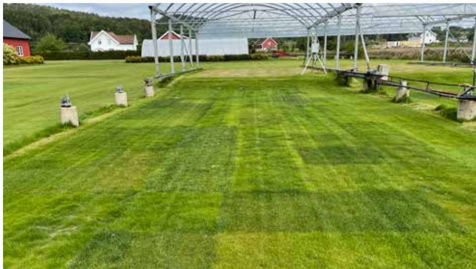
Experiment with 42 varieties representing 10 drought-resistant species/subspecies.

apart for most) to a Kentucky bluegrass/red fescue stand before imposing drought from 14 July to 8 September 2023. The products (and collaborating company) were: H2PRO Trismart (ICL), Qualibra (Syngenta), Magnum 357 Calibre (Indigrow), PBS 150 Liquid (Aqua Aid), Hydra 30+ (Aqua Aid), ProWet Evolve (RhizoSolutions/Turf Care), and Revolution. Additional treatments included a negative control (same drought period, but no surfactant) and a positive control that was irrigated to field capacity three times a week. Digital images were taken of each plot three times a week and analysed using the software Turf Analyzer ( https://turfalyzer.com ). Plots were hand-irrigated with 8 mm every time turf coverage was <70%. There were no significant differences in turf quality, turf coverage or water use between the surfactant treatments. On average for the seven products, water use during the 8-week period was 54 mm on surfactant-treated plots and 70 mm on untreated plots with reference evapotranspiration of 136 mm. This experiment will be repeated in early summer 2024.