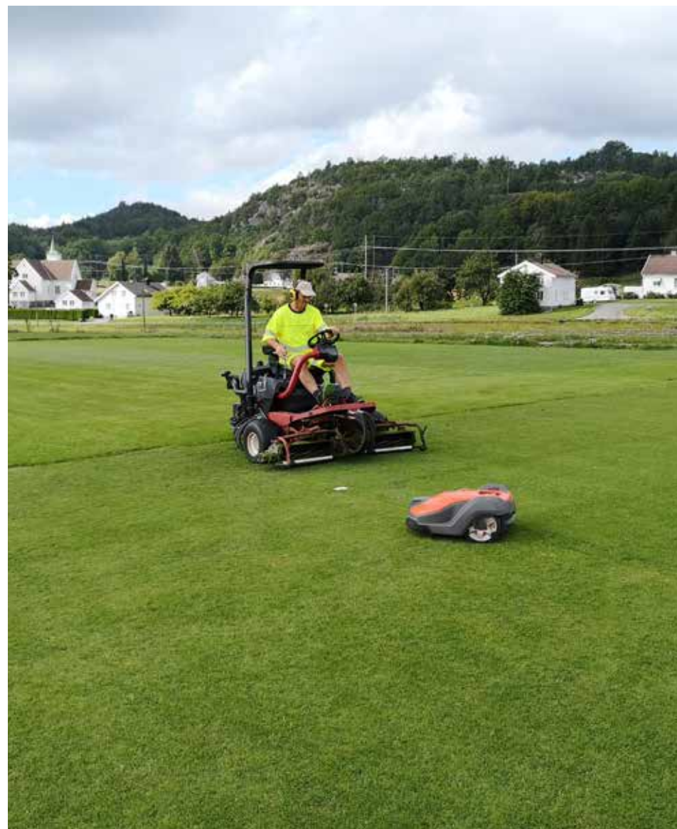
Conventional fairway mower and robot at Landvik.

A surveys of golfers indicated that they were positive or neutral to robot mowing, but they wanted local rules when robots interfere with the game. Unfortunately, due to malfunction of loggers, the ROBO-GOLF project was unable to assess changes in energy use and CO 2 footprint on switching from traditional (manual) to robotic mowing. Further research is needed to answer these questions.