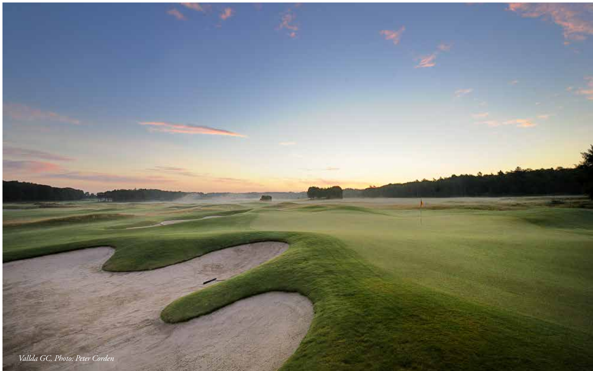
Vallda GC.