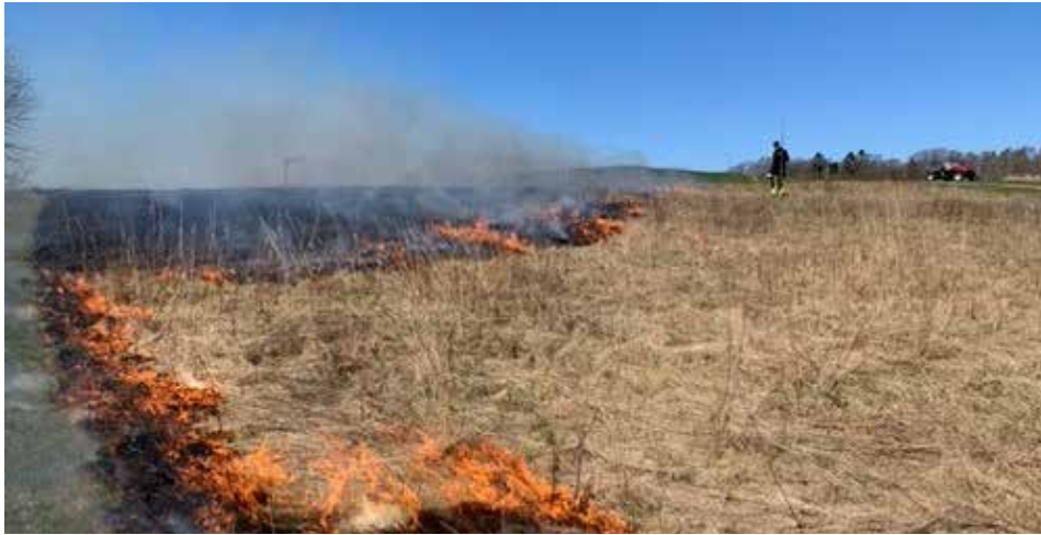
Grass surfaces were burned off on some courses.