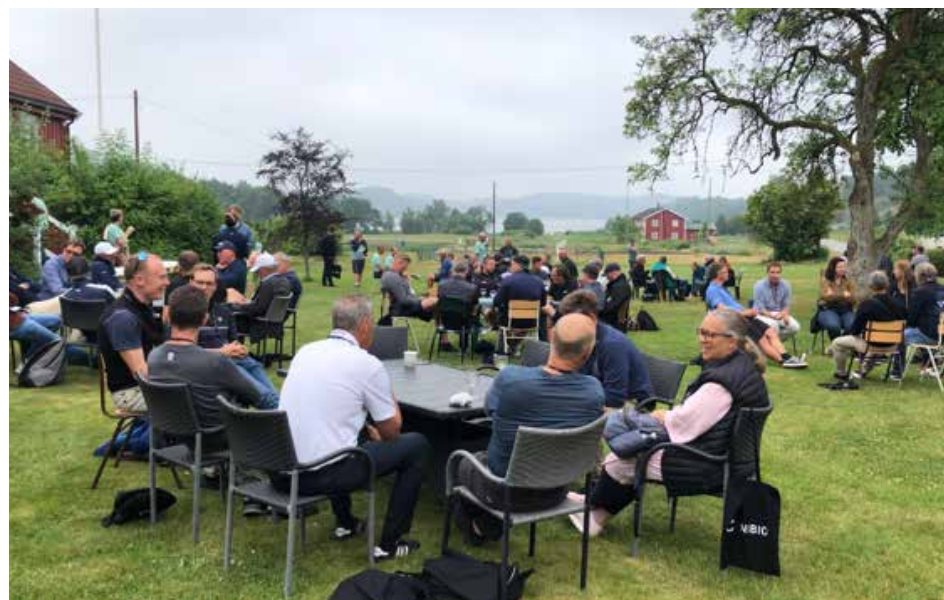
Turfgrass Field Day Lunch.

On June 20-21 2023, around 90 scientists, turfgrass agronomists, company representatives and practitioners from nine countries gathered for the NIBIO International