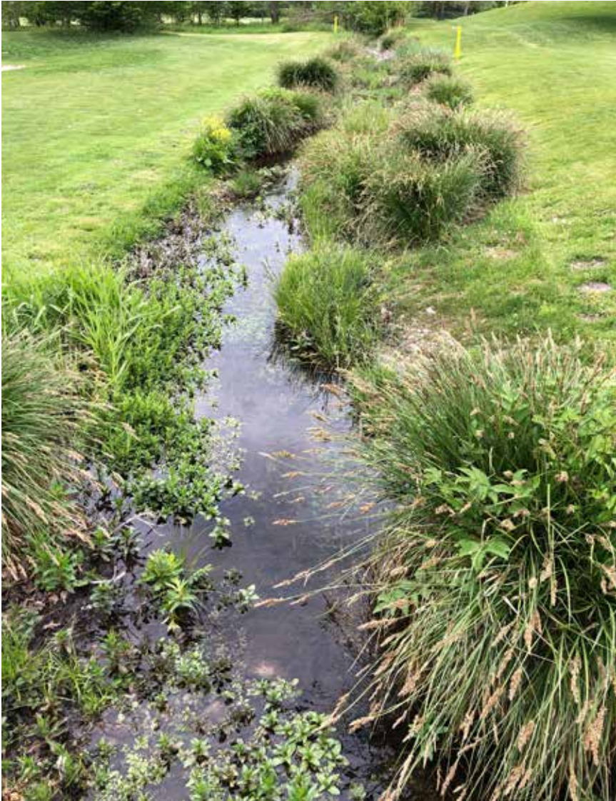
Restored water course GC Eichenried.