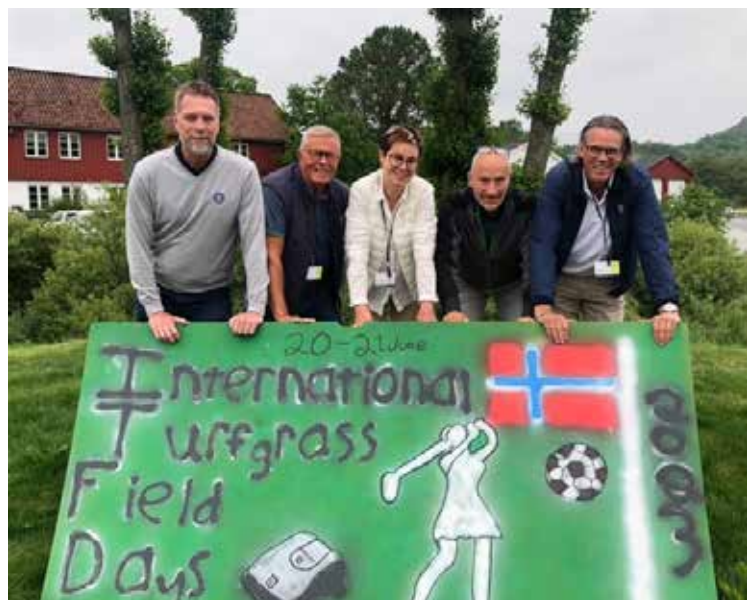
Turfgrass Field Day.

USA, gave a highly appreciated overview of cultural control of Microdochium patch and dollar spot, two of the most important diseases of cool-season turfgrass in Europe and North America.