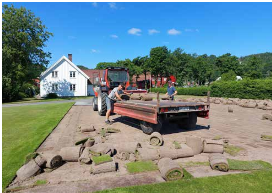
Removing turf from the old SCANGREEN. Landvik, July 2023.

New experimental greens were established at Apelsvoll and Smørum in June, and at Reykjavik and Landvik in July. Establishment was most successful at Reykjavik, while many of the plots had to be reseeded at Landvik in August and September. At Apelsvoll, plots with Kentucky bluegrass were also reseeded. At Smørum, most of the green was reseeded in August. In October, some of the plots with Kentucky bluegrass and smaller cat's-tail were still not fully covered at Landvik, Apelsvoll and Smørum. The challenges with establishment are likely explained by the very dry weather in Norway and Denmark in June. At Minnesota, the experimental green was established in early September due to problems with delivery of the seed package from Norway.