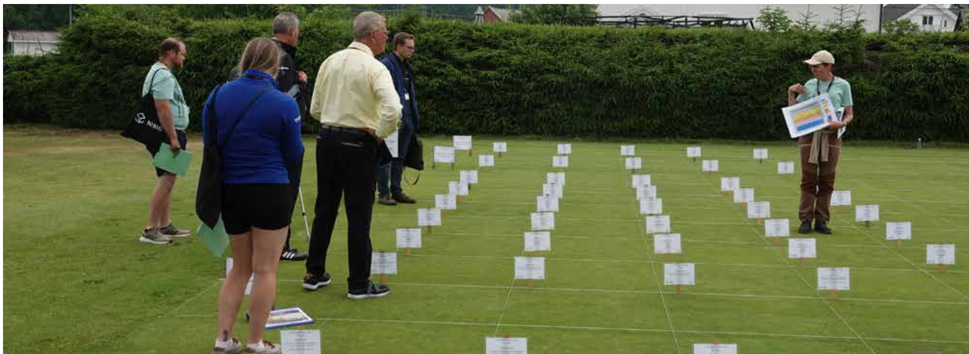
Delegates at NIBIO International Turfgrass Field days at Landvik on 20 June 2023 during a field walk in SCANGREEN 2019-2022 plots.

varieties of slender creeping red fescue ( Festuca rubra litoralis ) across the three sites, 'Sybille' performed best, followed by the control variety 'Cezanne'. Among varieties of colonial bentgrass ( Agrostis capillaris ) across the three sites, there was no difference between the varieties in overall turfgrass quality, but 'Jorvik' had the lowest overall winter damage and the least microdochium patch across all years. Among varieties of creeping bentgrass ( Agrostis stolonifera ) across the three test sites, the new varieties 'Matchplay', 'L-93 XD' and '777 Triple Seven' performed best, closely followed by 'Piranha' and 'Valderrama' which were in line with the control variety 'Luminary'. Among varieties of velvet bentgrass ( Agrostis canina ), 'Villa' remains the top variety for the Nordic countries. Among varieties of Kentucky bluegrass ( Poa pratensis ), the control variety 'Limousine' had higher turfgrass quality, higher tiller density, finer leaves and less in-season disease than the candidate 'Professor' on average for the Reykjavik, Apelsvoll and Landvik sites.