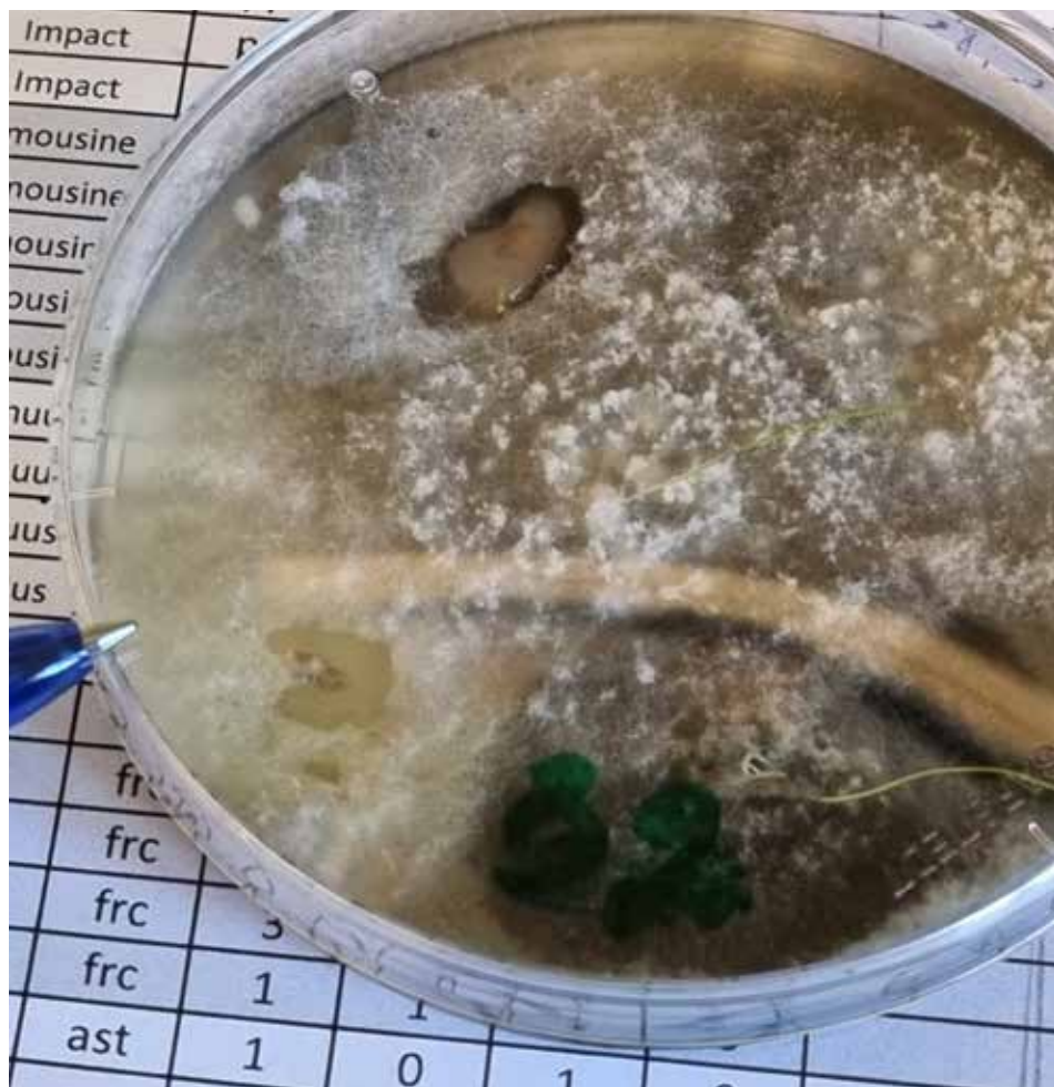
Screening of turfgrass species and cultivars for resistance to diseases at Landvik.